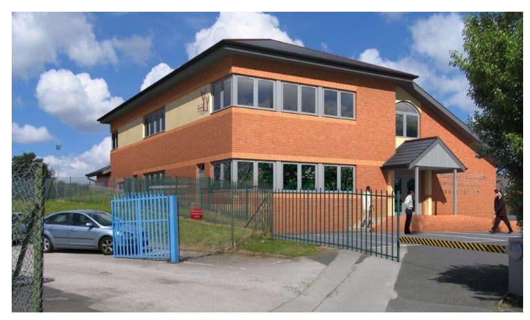
Artist impression of final build